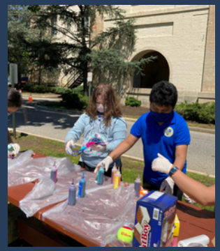
The Special Education annual trip was cancelled due to COVID. So ,instead they held a field day for their students and staff.